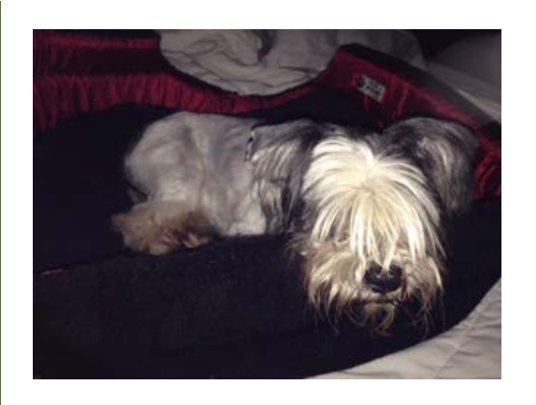
Jimmy: After being shaved.