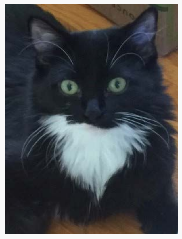
Violet She is the smallest of the three kittens and follows her sister's leads...she is also a

If you would love to add one of these beauties to your family, contact us at info@v4a.org or call 780-490-0905.